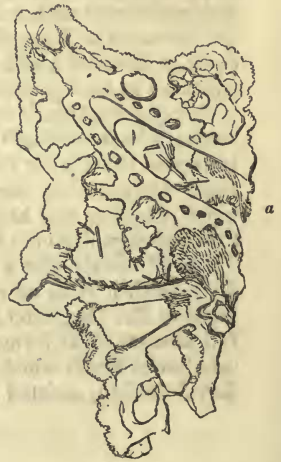
Fig. 3. Cross sunken cells, showing the spicula in the cells.